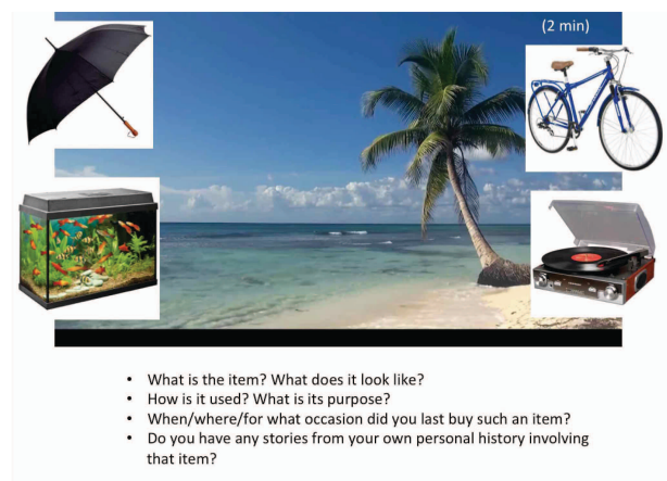
Figure 1: Picture-description task with calm audio-visual background