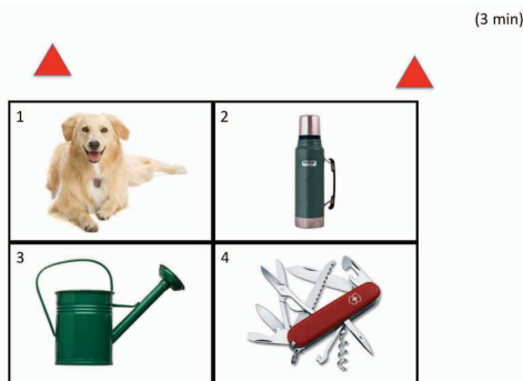
Figure 3: Picture-description task under cognitive load.

In the cognitive load condition, the picture description was paired with the task of keeping track of visual stimuli that