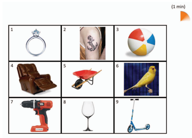
Figure 4: Screenshot of picture-description task under time pressure.

In the time pressure condition, the participants were shown a panel of nine pictures and told to describe as many of them as possible in one minute (see Figure 4). The remaining speaking time was indicated by means of a clock icon. After the first