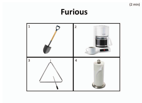
Figure 5: Screenshot of picture-description task with acted emotion ( furious ).

For a subset of 27 out of the total 43 participants, a number of additional picture-description tasks were added that asked them to perform the speaking task in a tone of voice that reflects a particular emotional state (see Figure 5). The four states of interest were furious , serene/relaxed , happy/excited , and depressed . 1 In each state, a different panel of four pictures was presented with a speaking time of 120 seconds. Preceding and following the four explicit emotional states were two more speaking tasks with a “neutral” tone of voice.