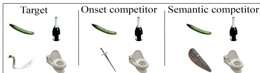
Figure 1: Display configurations for the target word zwaan , swan, featuring a target-present display, an onset competitor display ( zwaard , sword) and a semantic competitor display ( schild , shield), each along with three unrelated distractors.

All words in the experimental and filler sets were picturable. Photographs were selected from existing databases [16,17] or searched on the internet and edited to fit the resolution and size of the other pictures.