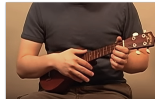
Fig. 1. An example ground-truth transcript which contains a rare visual word: “ and that’s how you tune a ukulele ”.

In the context of automatic speech recognition (ASR), the presence of a synchronized video stream of the narrator enables lipreading [2] a technique to reduce the effect of ambient noise. This approach can be defined as a local grounding since the grounding happens between phonemes and visemes which are their visual counterparts. On the other hand, global grounding can always happen even the recog-