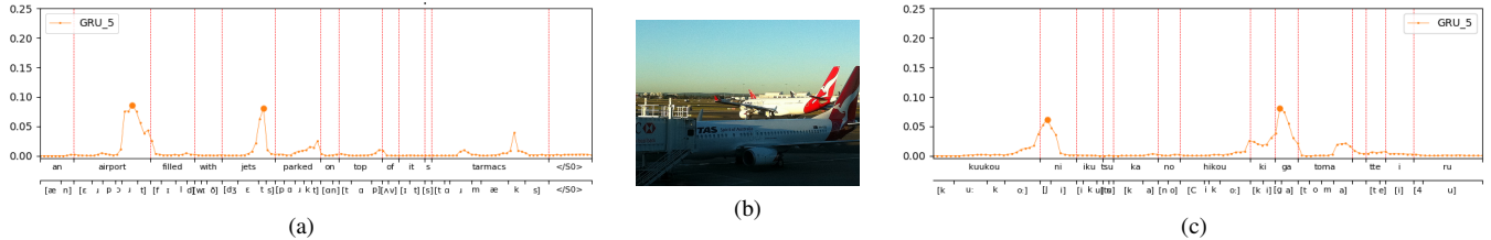
Fig. 2: Attention weights over an English (2a) and Japanese caption (2c), both describing the same picture (2b). Attention peaks in the English caption are located above “AIRPORT” and “JETS”. Attention peaks in the Japanese caption are located above “NI” (particle indicating location) and “GA” (particle indicating the subject of the sentence). Red dotted lines show token boundaries. Large orange markers show automatically detected peaks. Japanese caption reads: “Several planes are stopped at the airport”