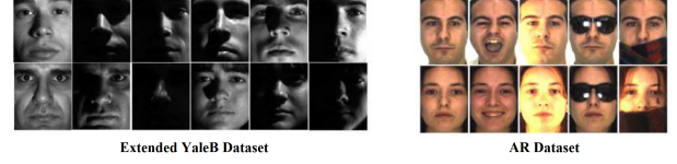
Fig. 1. Examples of Face Dataset: The left figure is Extended YaleB Dataset, and the right one is AR Dataset.

Extended YaleB: This face dataset contains in total 2414 frontal face images of 38 persons under various illumina-