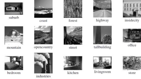
Fig. 4. Scene15 Dataset Examples

amples are listed in Fig.4. Proceeding as for the Caltech 101 dataset, we compute the SPM features for scene images. Each scene image is transformed to a 3000 dimensional feature by PCA. We randomly pick 100 images per class as training data, and use the rest of images as testing data. The settings and steps follow [6]. The dictionary size is set to 450, \lambda_1 = 0.001 , \lambda_2 = 10 , \lambda_3 = 4 , \lambda_4 = 0.001 and T = 220 .