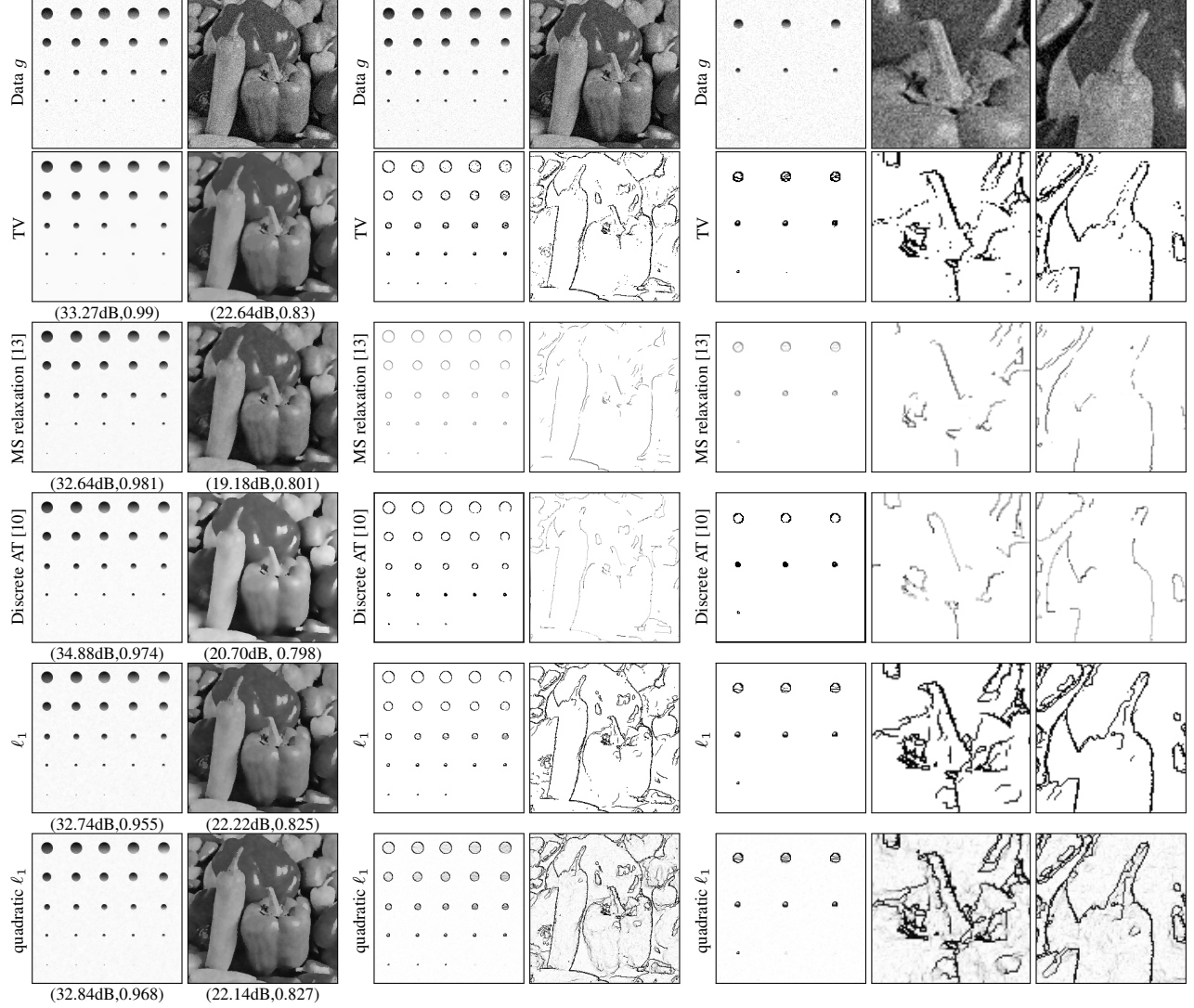
Fig. 2: Comparison of the proposed method with some state-of-the-art segmentation and denoising methods for two different images of sizes 128^2 and 256^2 . Left: denoising results ( u ) with (SNR,SSIM) values, middle: contours (extracted from a threshold over Du for TV, and from v for the other methods), right: zoom on the contours.

this method in the comparison. The proposed model is much faster than [10] for both choices of \mathcal{S} , in particular with the quadratic \ell_1 -penalization, for similar denoising and segmentation performances.