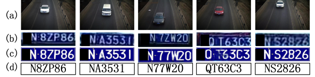
Fig. 3. Some results of the proposed LPR system: (a) the input images captured by cameras; (b) the license plates detected by Faster RCNN; (c) the outputs of GN; (d) the recognition results of DN.

exploits the GN in MTGAN to recover the images and uses EasyPR to recognize the characters. It achieves 11% high accuracy, which demonstrate the super-resolution power of the proposed MTGAN. Finally, MTGAN achieves the best performance, which significantly improve the recognition performance. This result demonstrates that MTGAN which combines super-resolution and recognition in one end-to-end framework can simultaneously improve the two task through adversarial learning.