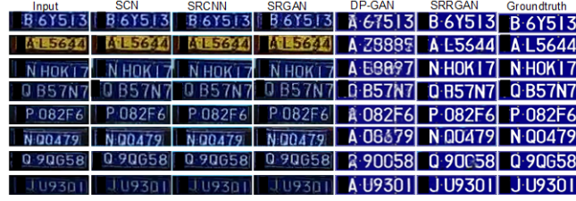
Fig. 2. The examples recovered by different super-resolution approaches.

(3) SRGAN [13] . SRGAN is a GAN-based method for image super-resolution. It proposes a perceptual loss function which consists of an adversarial loss and a content loss.