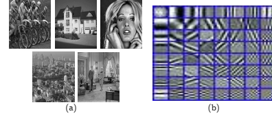
Fig. 3: (a): Training data for transform learning. (b): Learned 64 \times 64 sparsifying transform, with rows reshaped into 8 \times 8 filters.

We have limited our scope to removing Gaussian noise from an image using a fixed sparsifying transform using the SURELET algo-