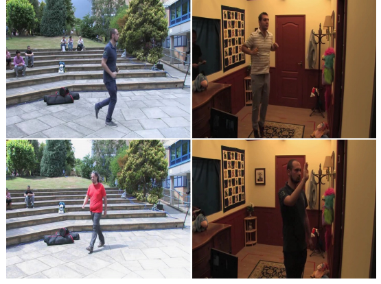
Fig. 1. Example frames from the IMPART video dataset. The respective activities are "Run" (top left), "Walk" (bottom left), "Jump" (top right) and "Hand-wave" (bottom right).

Thus each script was executed three times per actor. Three main actions were performed, namely "Walk", "Hand-wave" and "Run", while additional distractor actions were also included and jointly categorized as "Other" (e.g., "Jump Up-Down", "Jump Forward",