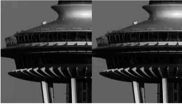
Fig. 3. Visual comparison of IP-GWP-GGFT (left) vs. DCT (right) over a cropped detail of image p26.

that makes it equivalent to ADST. We will refer to this variant as IP-GWP-GGFT.