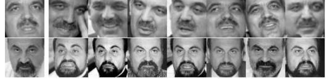
Fig. 2: Top: A testing image and 7 training images from LFWCrop. Bottom: A testing image and 7 training images from UFI.

We assessed the efficacy of our approach for face identification in unconstrained conditions using the cropped Labelled Faces in the