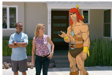
Fig. 1. Son of Zorn is one recent example of a media production that uses cartoon textures implanted within a real-world setting.

In this paper, we propose targeted style transfer, in which the style of a template image is used to alter only part of a target image. For example, an artist may wish to alter the style