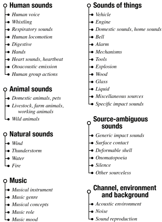
Fig. 1: The top two layers of the Audio Set ontology.

Wikipedia or WordNet descriptions (with appropriate citation URIs), adapted to emphasize their specific use for audio events.