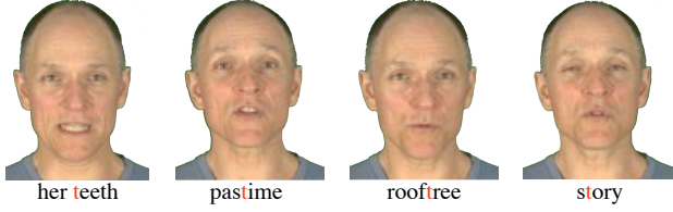
Fig. 1: A selection of movie frames during the articulation of /t/ illustrating the variability of articulator poses due to coarticulation.

visual speech independently of the underlying phoneme labels. Given some training video containing speech, the visible articulators are tracked and parameterized into a low-dimensional space. This parameterization is then automatically segmented by identifying salient points to give a series of short, non-overlapping gestures. These salient points are visually intuitive and fall at locations where the articulators change direction, for example as the lips close during a bilabial, or the peak of the lip opening during a vowel. The speech gestures identified by this segmentation are then clustered to form dynamic viseme groups, such that movements that look very similar appear in the same class. Identifying visual speech units in this way is beneficial as the set of dynamic visemes describes all of the ways in which the visible articulators move during speech. For the remainder of this paper visemes refers to dynamic visemes as defined in [17].