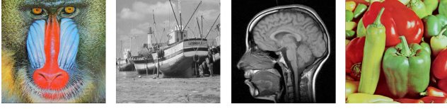
Fig. 2. Test images.