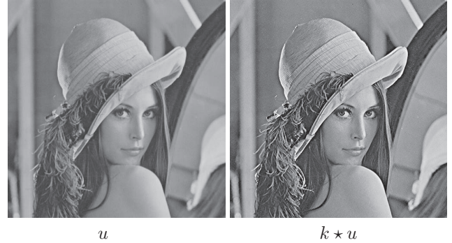
Fig. 2. Blind deconvolution of Lena image. Selecting the separable symmetric 21 \times 21 kernel k that maximizes the Sharpness Index of k \star u ( u being the original Lena image, bottom left) results in a sharper image (bottom right) that reveal some details of the original image, while keeping noise and ringing at an acceptable level.

perspectives, both from a theoretical viewpoint (the explicit formulas will probably ease further analyses) and as concerns applications (in particular image restoration), for which computation time and estimation errors are no more a limitation.