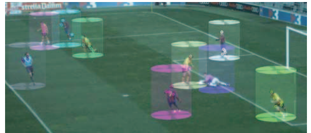
Fig. 3. Clustering of 3D features; each player is identified by one cylinder, the features are shown by small circles; the same color indicates the same cluster.

After extracting features from dynamic items, the 3D information can be exploited to identify players by clustering the features.