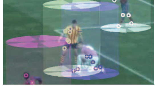
Fig. 5. Feature assignment; each color defines one region U_i , circles indicate features belonging to the 3D set \tilde{S}_i^t , crosses indicate features that do not belong to the same set, however have been extracted from region U_i .

If there is more than one player in region U , we find for each \tilde{p}_i^{m,t} its nearest 3D cluster C_i with respect to 3D distance, and assign \tilde{p}_i^{m,t} to the 3D set \tilde{S}_i^t . An example is shown in Fig. 5.