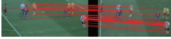
Fig. 2. SIFT features in left and right reference images.

First, we define a view group which includes both spatially correlated views V_{l,t} , V_{r,t} and temporally correlated views V_{m,t} , V_{m,t+1} with respect to time t , as depicted in Fig. 1. We extract SIFT features in views V_{m,t} and V_{m,t+1} , and find correct correspondences. Let p_i^{m,t} \leftrightarrow p_j^{m,t+1} be a temporal feature correspondence, where p_i^{m,t} denotes the i -th feature point with the image coordinate (x_i^{m,t}, y_i^{m,t}) in the view V_{m,t} and p_j^{m,t+1} the j -th feature point with the image coordinate (x_j^{m,t+1}, y_j^{m,t+1}) in the view V_{m,t+1} . As we assume that the sports events are captured by an array of fixed high-definition cameras, the static scene can be generated by traditional temporal median methods [7]. Thus, feature correspondences which belong to the static scene can be easily filtered. In that scene, the remaining correspondences are related to the moving items between two successive frames, hence, they can be used to obtain tracking information. We define two sets of moving features for views V_{m,t} and V_{m,t+1}