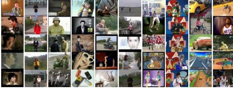
Fig 3: Thumbnails of 10 video clusters