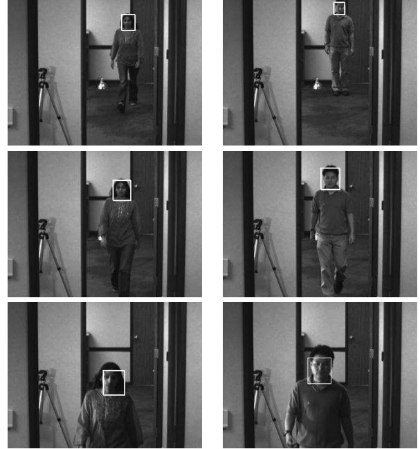
Fig. 2. Face tracking using PF-MT as the individuals walk through different lighting conditions. The white box shows the image region corresponding to MMSE estimate of the “shape vector”.