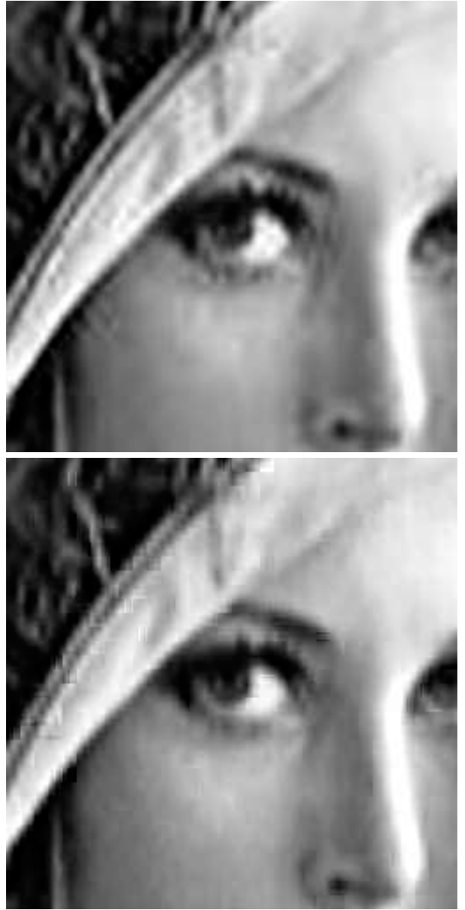
Fig. 2. 4 times interpolation on a detail of Lena: bicubic (up), regularity-based (bottom)