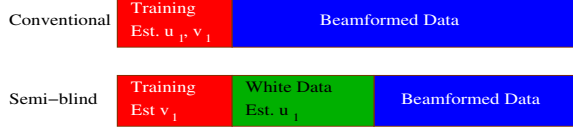
Fig. 1. Comparison of the transmission scheme for conventional least-squares (CLSE) and closed-form semi-blind (CFSB) estimation.

estimation techniques using two measures, the MSE in the estimate of \mathbf{v}_1 and the gain (the power amplification/attenuation) of the one-dimensional channel resulting from beamforming with the estimated vector \hat{\mathbf{v}}_1 .