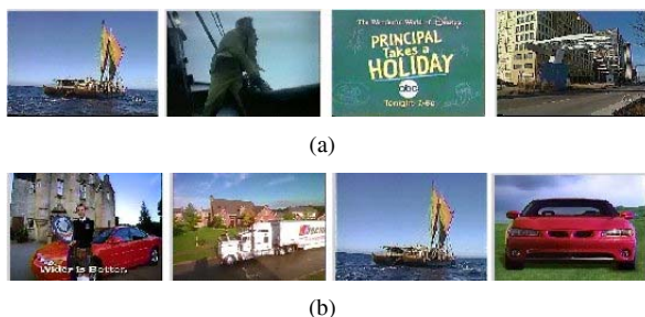
Fig. 3. First 4 ranked results for the query “Outdoors, Sky, Transportation”.

Figures 2 and 3 show the top 4 images in rank order using both CRM and normalized CRM corresponding to the text queries “basketball” and “outdoors sky transportation” respectively. We see that normalized CRM does much better than CRM.