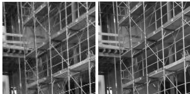
Fig. 2. Results of the super-resolution algorithm. The (255x255) original image is perfectly reconstructed (right) from a set of five low resolution (128x128) images (left).