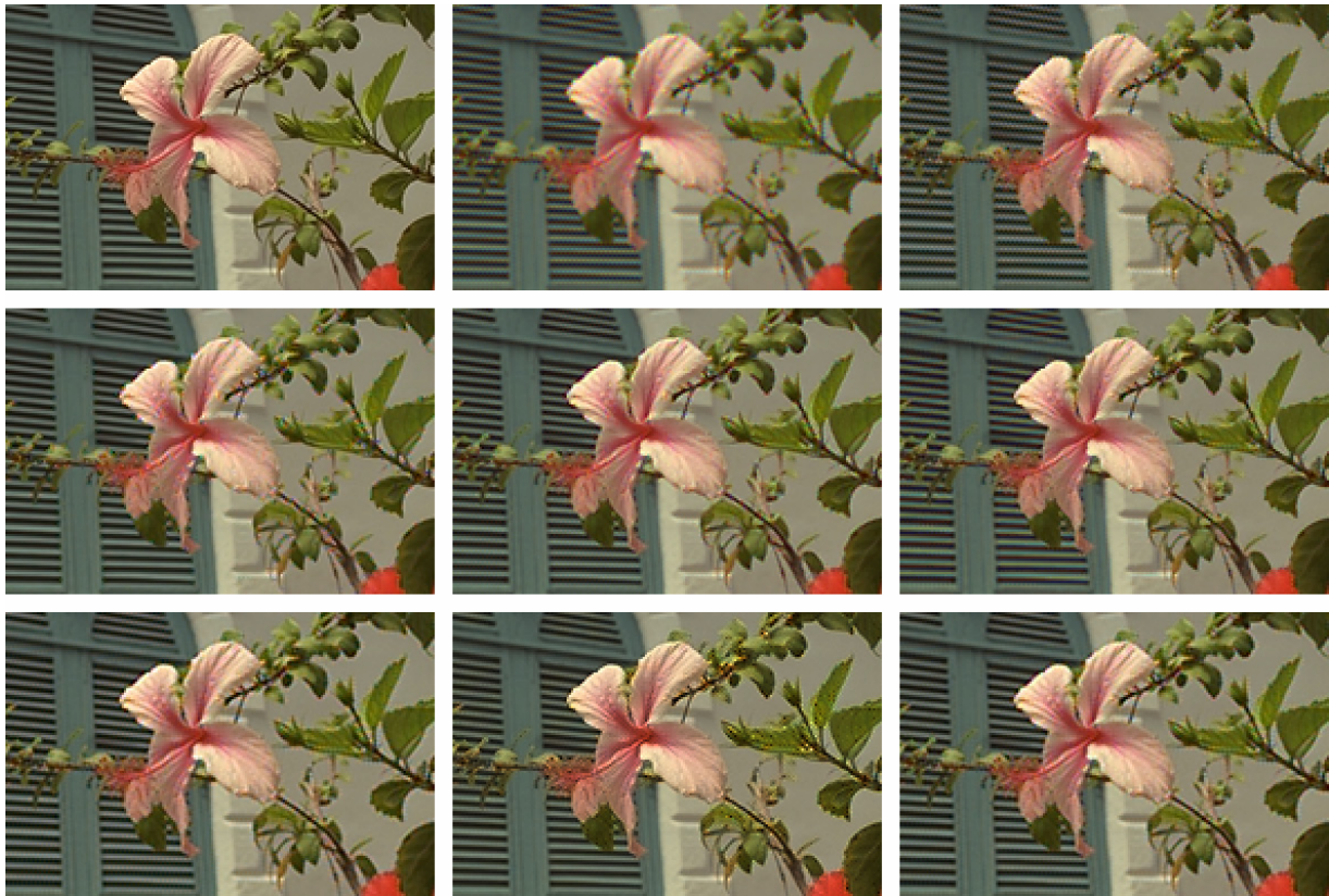
Figure 3. Demosaicing results for various interpolation algorithms. From left to right; top row: original, bilinear, Freeman [2],[5]; middle row: Laroche-Prescott [2],[6], Hamilton-Adams [6],[7], Chang et. al. [8]; bottom row: Pei-Tam [4], Kimmel [3], and our proposed method.