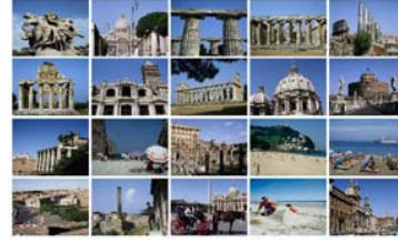
fig. 3b Initial retrieval- 15 ground truth images found, ANMRR = 0.3439