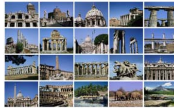
fig. 3c First relevance feedback - 17 ground truth images found, ANMRR = 0.2778