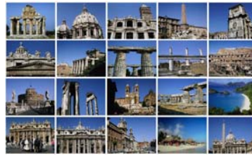
fig. 3d Second relevance feedback - 18 ground truth images found, ANMRR = 0.2322