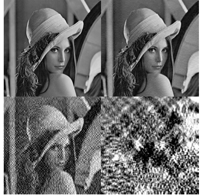
Figure 2: Quality layers scrambling of a codestream where three layers have been defined. Decoding by an unauthorized party (top left) original image. (top right) third layer is scrambled. (bottom left) second and third layers are scrambled (bottom right) all layers are scrambled.

layers differ from one code-block to another, and consequently apply a finer control on the distortion introduced in the final image when decoding without knowing the seeds. This enables scrambling of regions of interest in an image.