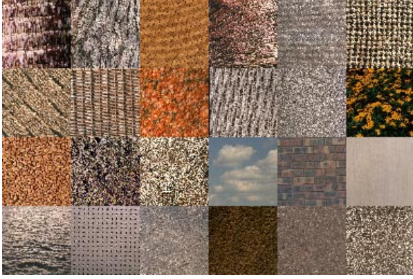
Fig. 1. Textures from the Vistex Database: Bark0; Bark12; Fabric0; Fabric4; Fabric7; Fabric8; Fabric11; Fabric13; Fabric15; Fabric17; Fabric19; flowers0; Food.0000; Leaves12; Grass1; Clouds0; Brick0; Wood2; water0; Tile7; Stone4; Sand.0000; Misc2; Metal0.

of the classification decision taken as: