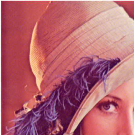
Part of I_W ( \mu = \mu_{Perc'} )