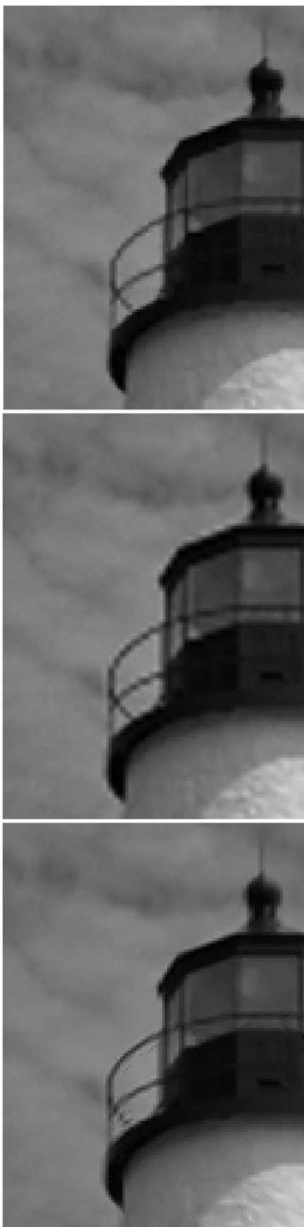
Fig. 3. Altamira (top), Cubic (center), Optimal-Recovery (bottom).