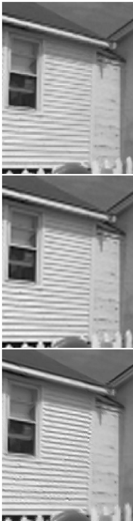
Fig. 4. Altamira (top), Cubic (center), Optimal-Recovery (bottom).