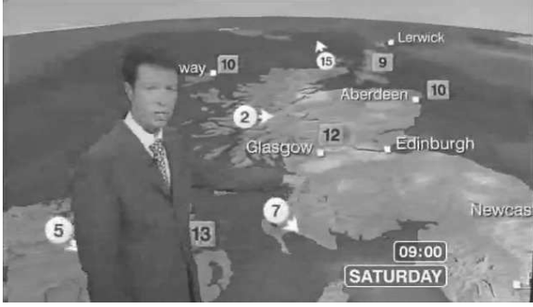
Figure 2: A screenshot of a Weatherview report.